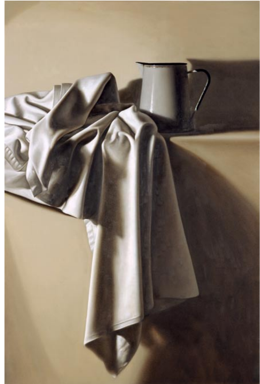
Pitcher, 2000, oil on canvas, 120 x 80cm