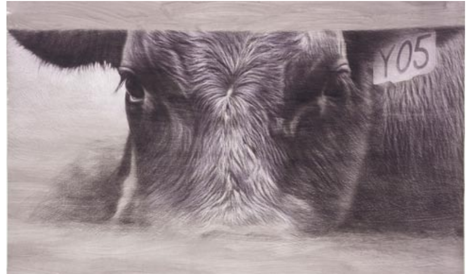
Luciance, 2007, mixed media on paper, 145 x 232cm Sitting Bull, 2003, black & white chalk on toned paper, 160 x 220cm