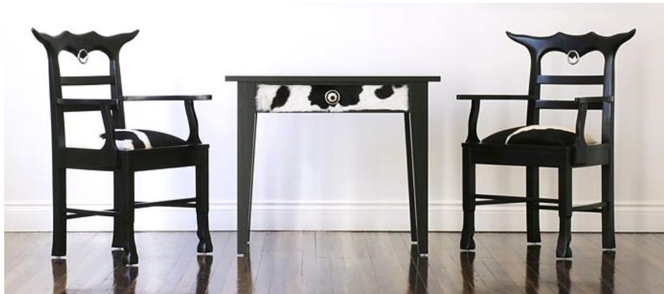
Ferninand Rocker, 2006, solid Tasmanian blackwood & upholsterd cowhide Moo Table & Chairs, 2006, solid Tasmanian blackwood, stainless steel & cowhide