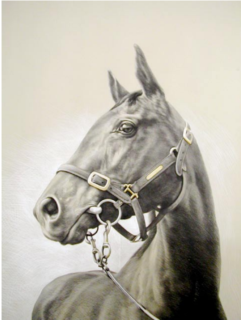
Rationalised, 2006, black & white chalk on toned paper, 130 x 192cm