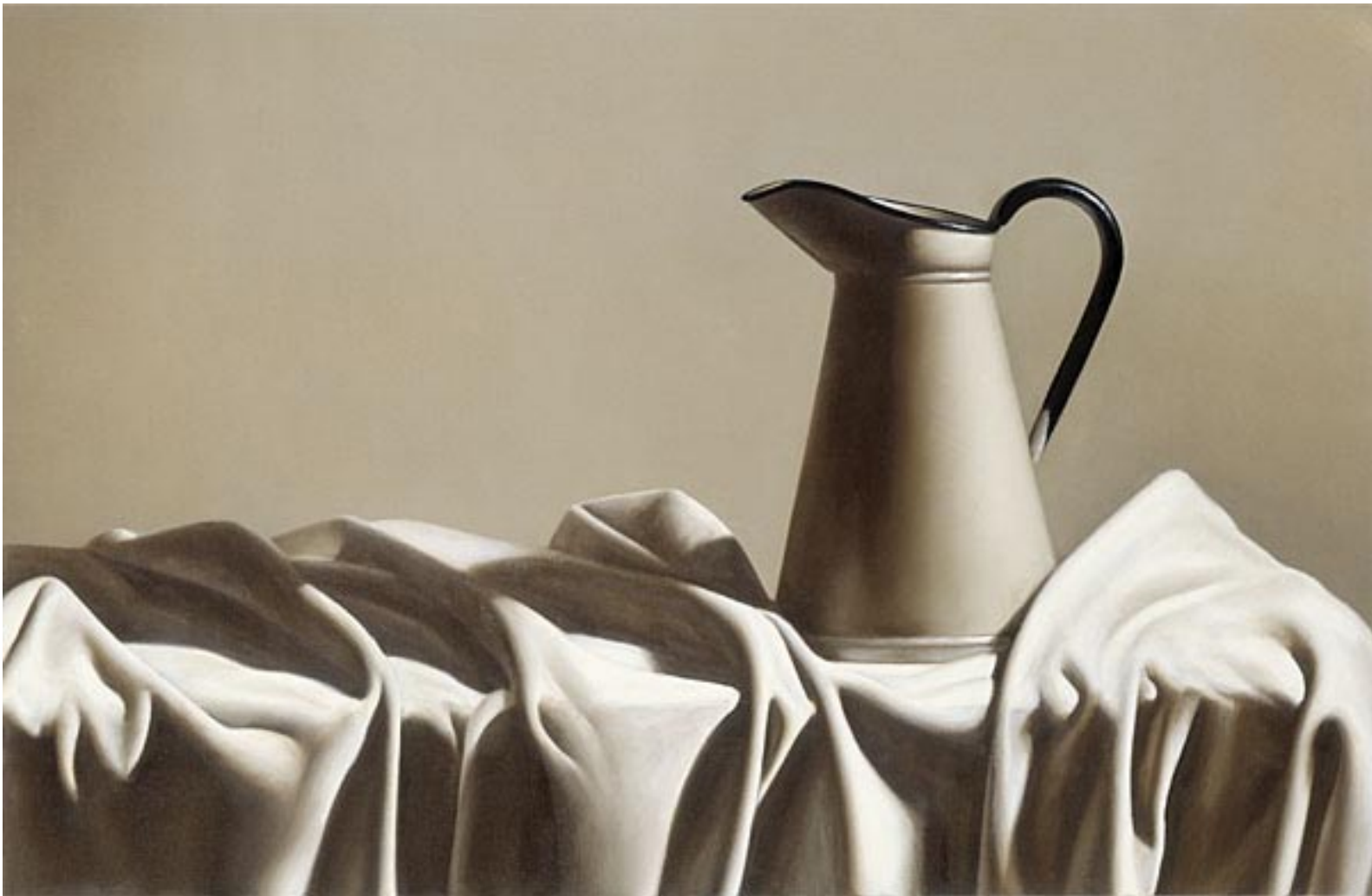
Pitcher, 2004, oil on canvas, 61 x 91cm