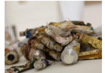
Angus McDonald studio 2007