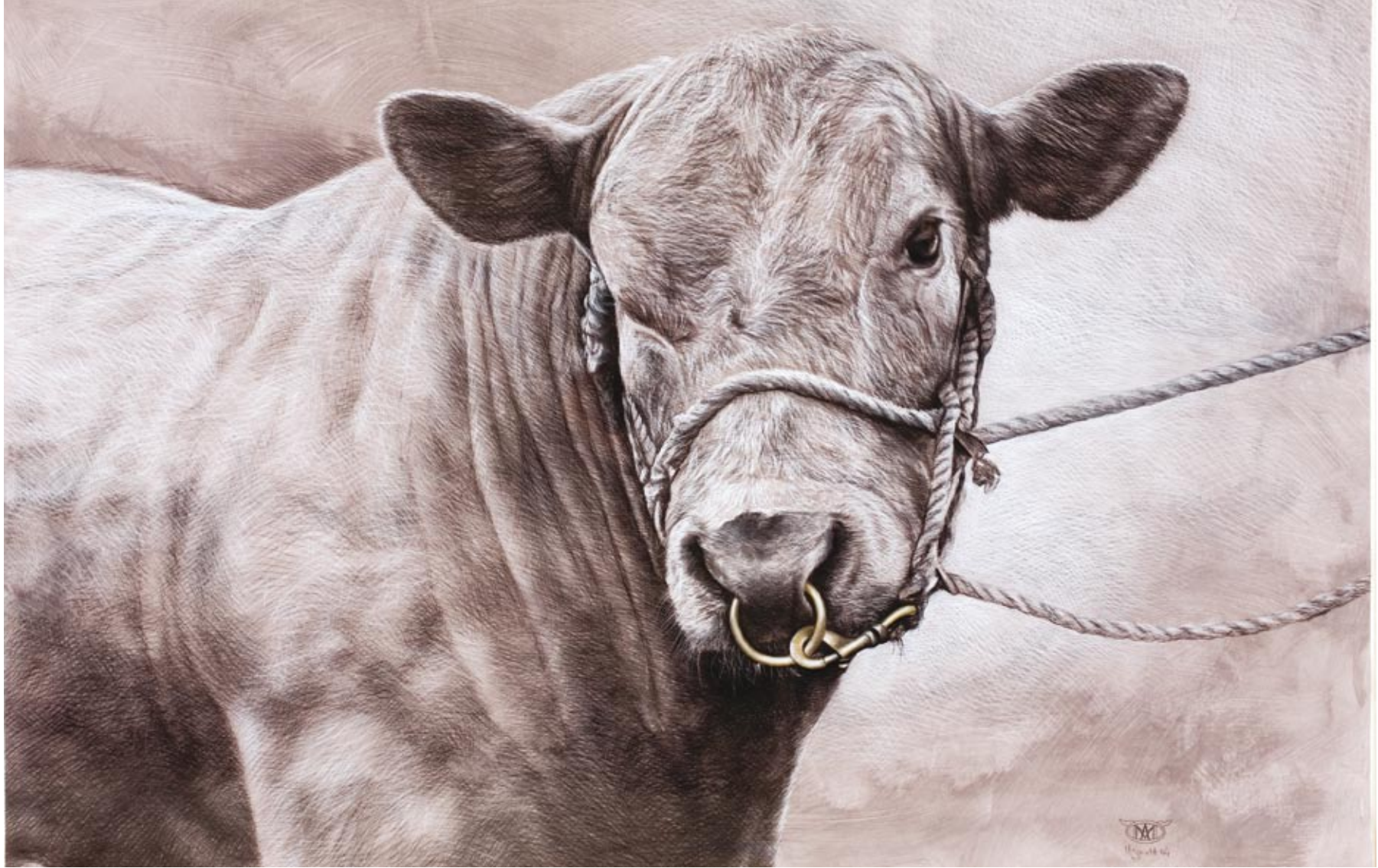
Warren, 2007, mixed media on paper, 150 x 220cm