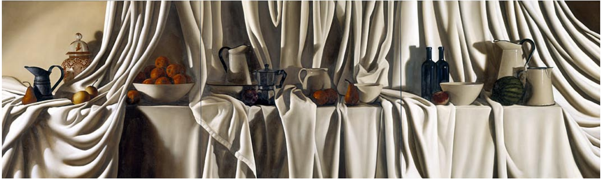
Still life, 2005, oil on canvas, 330 x 110cm