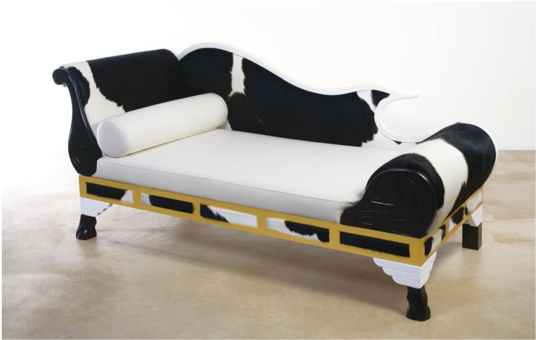
Conseula Chaise, 2008, blackwood, cowhide, leather, gold leaf, lacquer finish, painted finish, 2000 x 970 x 920mm