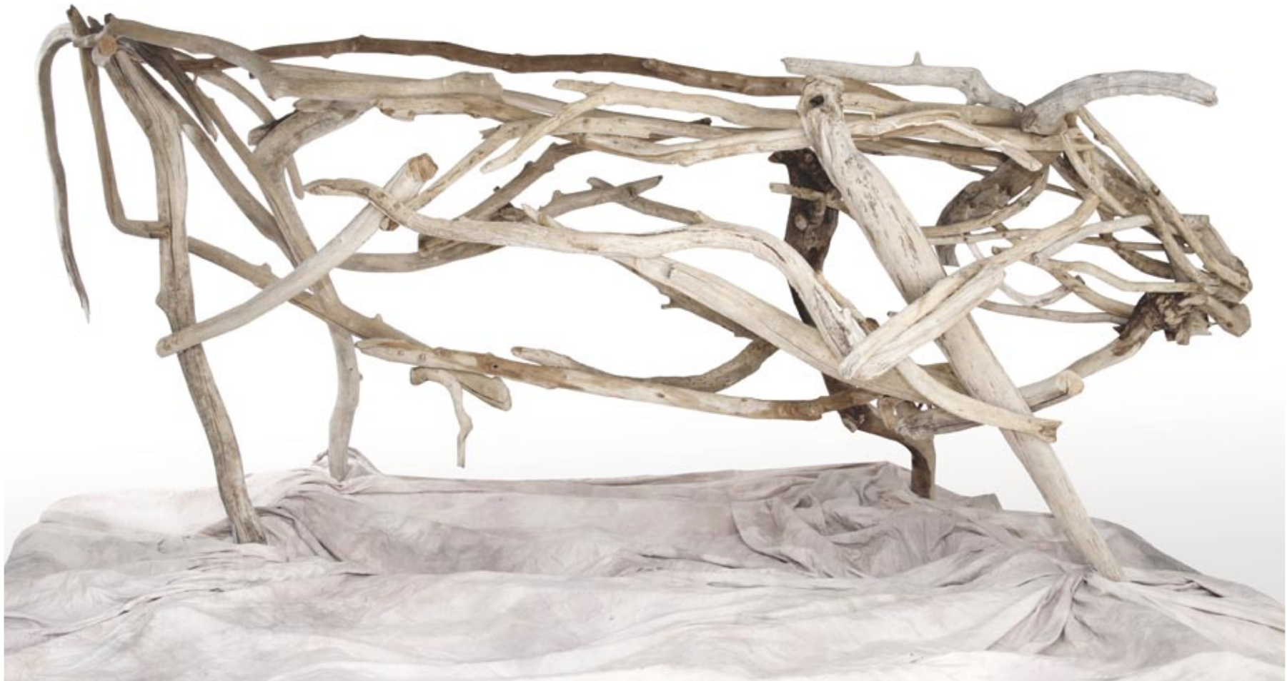
Gustavo, 2008, found driftwood, dowel, stainless steel, sealer, 324 x 136 x 127cm