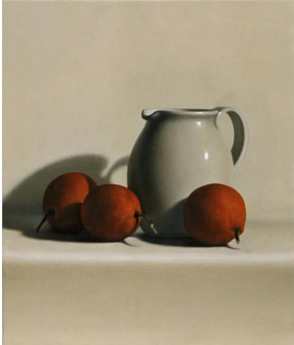
Jug and tangelos, 2002, oil on canvas, 53 x 45cm