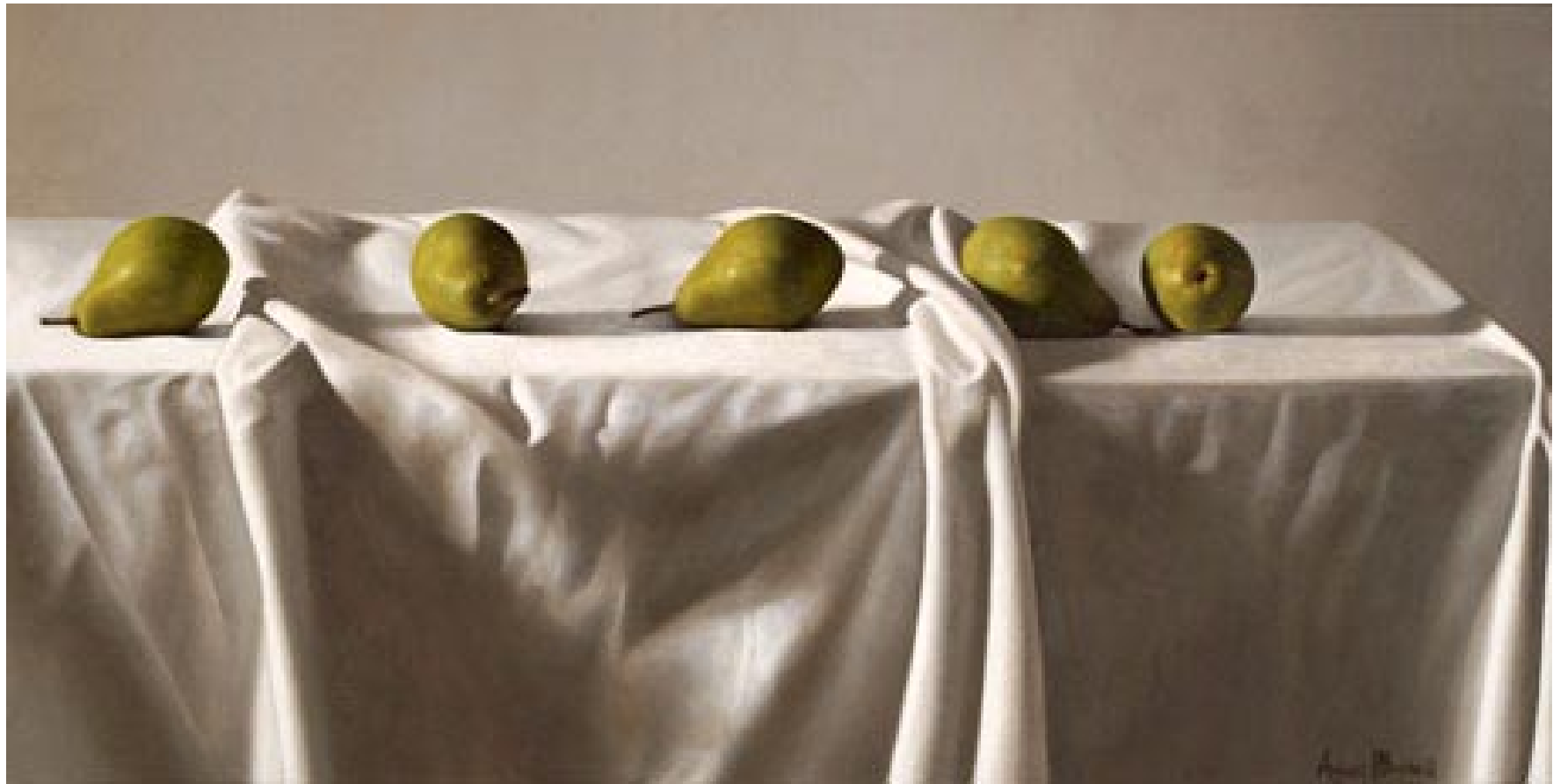
Aklathia, 2001, oil on canvas, 45 x 86cm