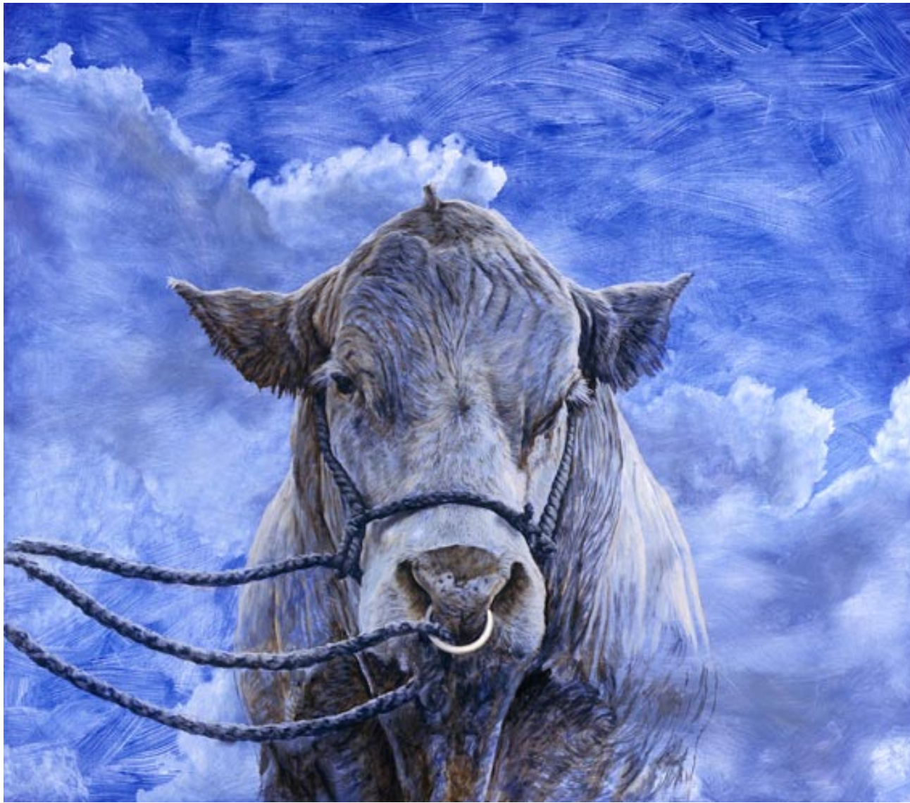
Buffet, 2008, mixed media on paper, 175 x 200cm